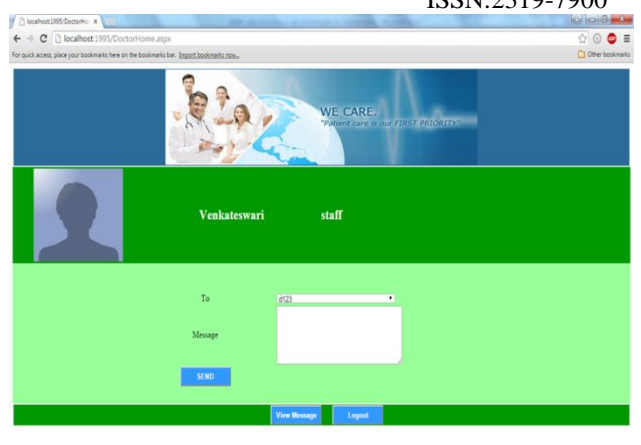
Figure 4. User Home Page

A doctor may get incoming messages from other doctors in the hospital, nurse or by the patient like a screen is represented in fig 5.