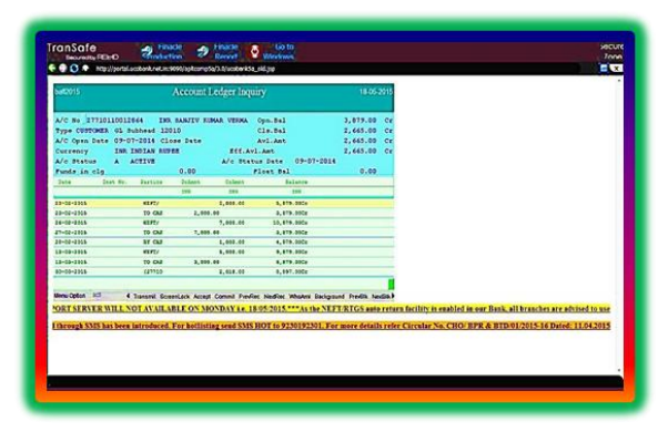
Fig:-Enquiry facility available at branch level

Accurate computing of cumbersome and timeconsuming jobs such as balancing and interest calculations on due dates.