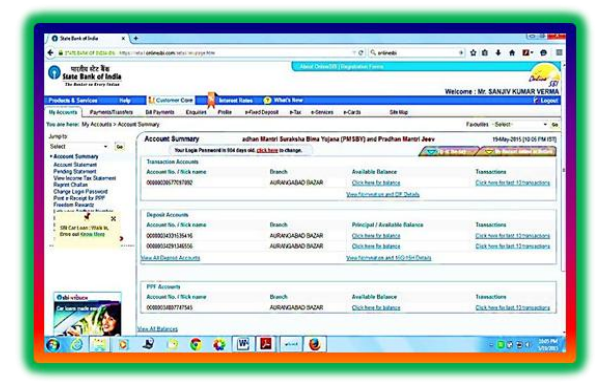
Fig-Internet Banking Facility

Banks are aware of customer's need for new services and plan to make them available, Information technology has increased the level of competition and forced them to integrate the new technologies in order to satisfy their customers such as,