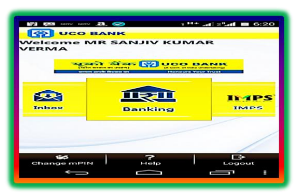
Fig:-Mobile banking facility

transformations in banking and financial sector are ECS , RTGS , EFT , NEFT , ATM , Retail Banking, Debit & Credit cards, free advisory services, payments of utility bills, fund transfers, internet banking, telephone banking, mobile banking, selling insurance products, issue of free cheque books, travel cheques and many more value added services. So the advantages accruing from computerization or transformation of technologies are three-directional –i.e. to the customer, to the bank and to the employee .