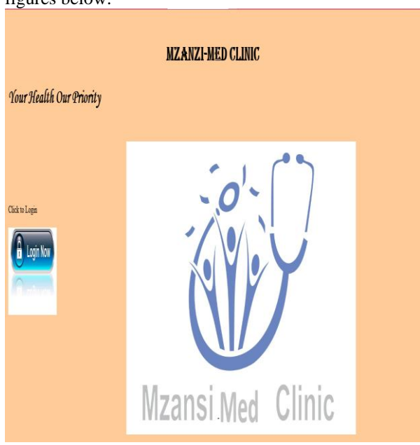
Figure 4. 1 Login In Page

The results from the developed system can be seen in the figures below: