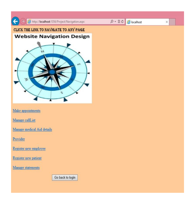
Figure 4. 2. Mzanzi med naviagtion