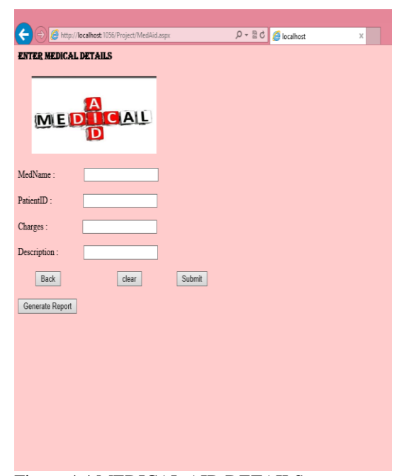
Figure 4.4.MEDICAL AID DETAILS