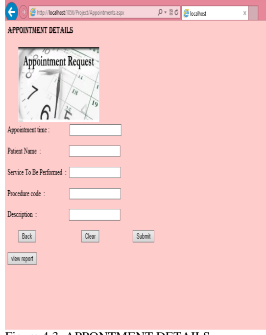
Figure 4.3. APPONTMENT DETAILS